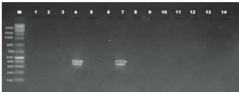
Figure (2): Gel electrophoresis of PCR amplification has with mcr-1 (413 bp) primer for CRKP extracted DNA. The electrophoresis was carried out for 80 min at 70 volts. M: DNA molecular marker; Lane (4 and 7) positive mcr-1 gene.

polymyxin B or colistin. All the three mcr-1 -positive carbapenem-resistant K. pneumoniae -related infections were classified as nosocomial infections (obtained from inpatients). The three isolates show resistant to all the 12 antibiotics tested, which means they could be categorized as pan-drug resistance agents. The MLST results showed that the three mcr-1 positive isolates were assigned to three different Sequence Typing STs: ST147, ST15, and ST11.