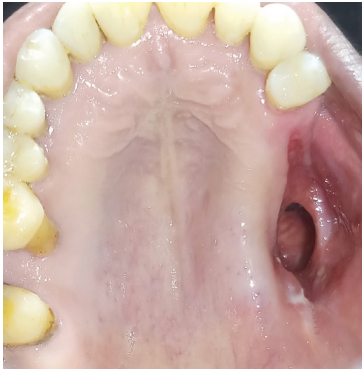
Figure 2: Dehiscence after surgical closure of large OAC using buccal fat pad.