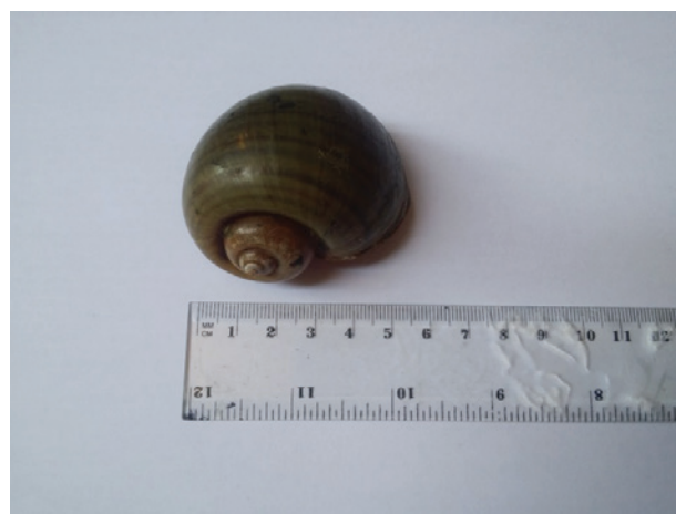
Figure(1): Lymnaea auricularia snail