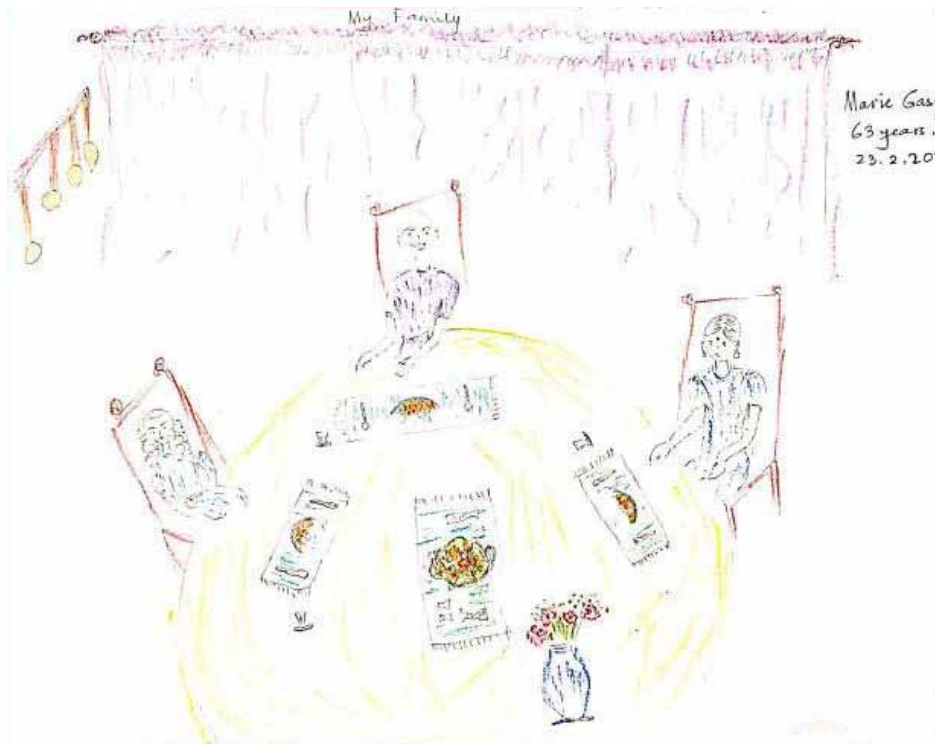
3rd session (February 2020)

3rd Session: After the second session of KFD the client has started looking at life with a different perspective. The client is feeling calmer & positive.