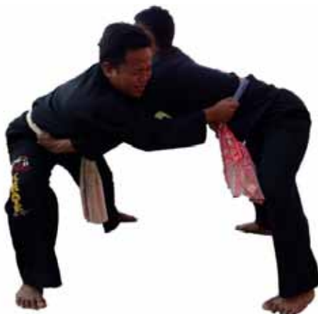
Figure 5. Side stance

Step Pattern: The pattern of steps in Pathol martial arts is carried out before the match and during the match. The pattern of steps before the match starts with stepping your left foot forward, then stepping your right foot sideways parallel to your left foot. This pattern of steps indicates the player is ready to start the match and is waiting for a signal from the midfielder. The stride pattern during the competition includes the forward, backward, right side, and left side step patterns. This pattern of steps is used when defending or slamming an opponent.