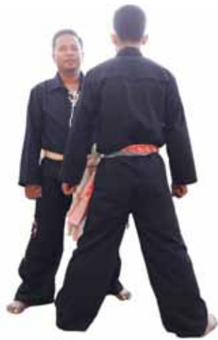
Figure 3. Middle mount

Stance: The stance in the pathol martial arts includes the middle stance and the side stance. The stance is used for both attack and defense. The movement of the stance in Pathol martial arts requires strong leg strength and strength because the essence in Pathol martial arts is to knock down the opponent so that the coordination of the legs in the stance must be good so that it is difficult to slam down when defending and easily knocks the opponent down when attacking.