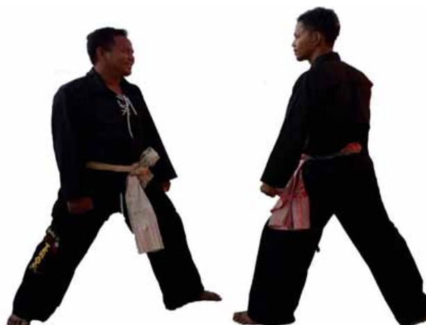
Figure 2. Front mount

Basic Movement of Nest Pathol: The tide stance in Pathol martial arts is carried out by standing upright with the arms beside the body and the legs straight up, then the left leg is lifted forward with the front leg bent slightly and the hind leg straight. The next tide stance is to pull the right leg behind it to the right side in line with the left leg. position of the legs are not parallel to the legs of the opponent when paired with the legs of the middle stance. The position of the pairs is a sign that the pathol player is ready to compete and is waiting for a signal from the midfielder, as in the image below which starts in Figure 1 and then continues in Figure 2.