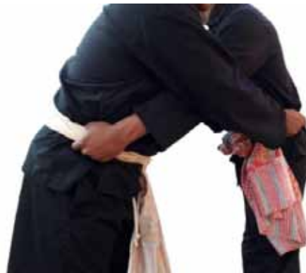
Figure 6. Hand holding

Holding hands: Hand holding in Pathol martial arts is done by inserting the hand into the udhet/belt through the bottom. Hand holding must be strong because it is used to slam the opponent, besides that it can also be used as defense. Pathol martial arts are dominated by hand grip movements so this movement is very important to master.