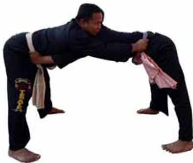
Figure 4. Middle easel

Stance: The stance in the pathol martial arts includes the middle stance and the side stance. The stance is used for both attack and defense. The movement of the stance in Pathol martial arts requires strong leg strength and strength because the essence in Pathol martial arts is to knock down the opponent so that the coordination of the legs in the stance must be good so that it is difficult to slam down when defending and easily knocks the opponent down when attacking.