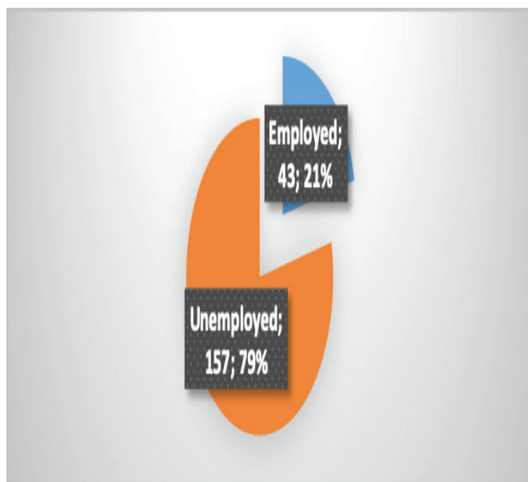
Figure 2: Categorization of Job Status of Research Subjects

Besides, data on Kalinese women who were working is 43 people, and who did not work is 157 people. An Explanation is illustrated through the following graph: