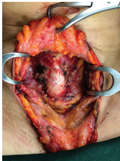
Figure 1. An exposed multinodular gland