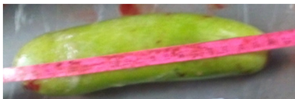
Figure 4: Recovered bottle gourd from the rectum.