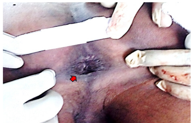
Figure 3: Anal opening observation one tear saw at 08 o'clock position indicated by the red arrow.