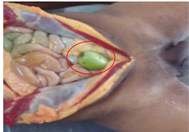
Figure 2: A green bottle gourd is in a circle in the rectum in red.