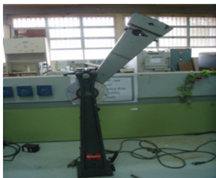
Fig (2) impact testing device

The test was assessed subsequent the technique recommended by the use of Charpy device. The samples were sustained horizontally at each end and hit by free fluctuating pendulum of two Joules and digital paradigm to show the impact energy fig (5). The measurement analysis provides the impact energy in Joules. The amount of the strength at unnotched specimens was intended in kilo Joules per square meter (KJ/M 2 )