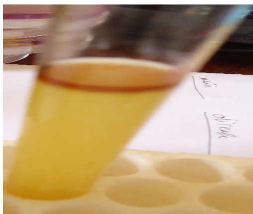
c) Indole for E. coli