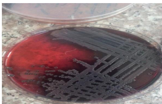
a) Salmonella spp. on SS agar

Cultural and biochemical characteristics of different species of bacteria isolated from faecal samples of affected dogs are depicted in figure 1.