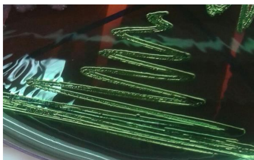
b) E. coli on EMB agar