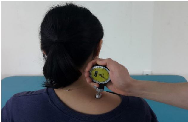
Figure 2. Pressure pain threshold measuring method

before and after massage application were used as comparators [11] [Figure 2].