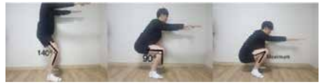
Figure 2: 140°, 90°, Maximum

that affect their balance, and 4) Person who do not have progressive or neurosurgical disorders. The exclusion criteria are those uncomfortable with the study, and that are taking supplements. This study was approved by Institutional Review Board (SM-201804-021-2) Institutional Physiological Ethics Committee.