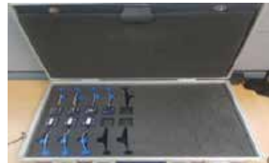
Figure 4: EMG(Electromyography) Matlab

We measured the balance during squat operation using Matlab program in UINCARE (UINCARE - 82B, Korea, 2016.) MATLAB is a mathematical engineering program that allows you to measure the motion of the center of gravity(COG) in the direction of the Ant-Post, Vertical, and Medial-Lateral while the subject is moving. The method of use automatically measures the COG when the object or object is in front of the device after executing the program and shows the axis movement for the set amount of time.