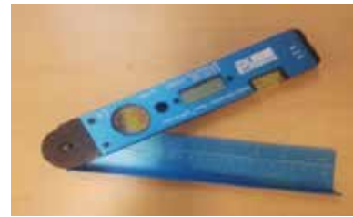
Figure 3: Goniometer